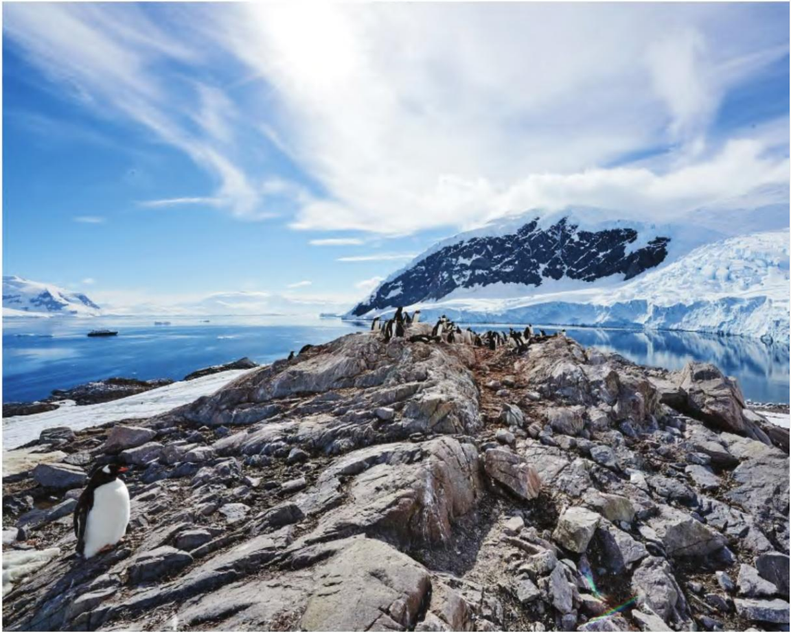
Gentoo penguins patrol a rocky outcrop against a thrilling backdrop of ice and water.

It's difficult to get a sense of scale in Antarctica. What appears to be an island in the distance becomes a great wall of ice that at times glares with white-hot intensity and at others glows with a deep-blue resonance. Cracks in the icy facades become cathedrals as they slip from the mist, great shrines to the elements that forge and shape Antarctica's frozen crown. A whiff of spray, gone in an instant, heralds the arrivals of killer whales and slate-coloured rifts in the brilliantly white landscape become curious crabeater seals, basking on the sea ice, which eye us as the Hanse Explorer silently approaches.