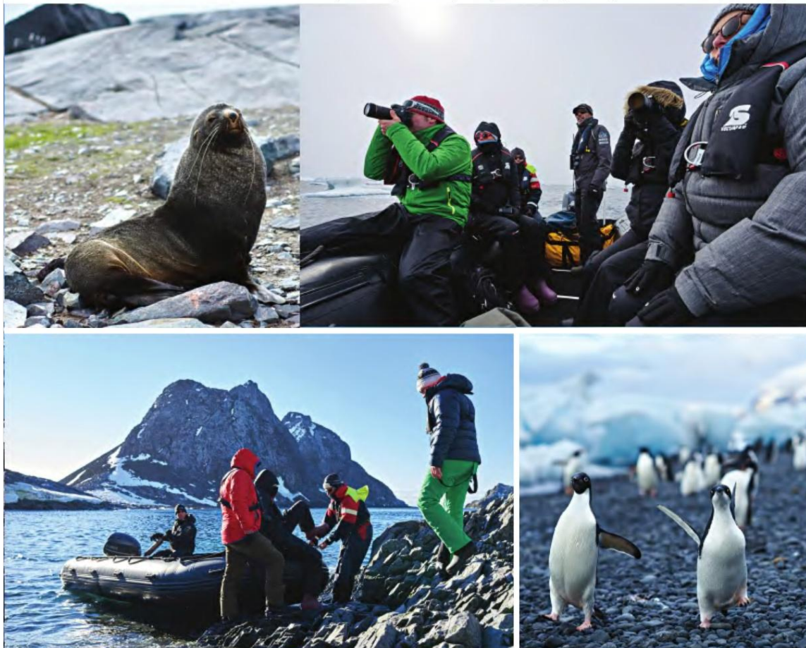
It's hard to get a sense of scale in Antarctica, where the icy landscape glows with white-hot intensity.