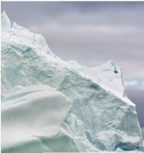
LEFT & BELOW: The Hanse Explorer has the manoeuvrability that larger commercial cruise ships could only dream of amid the wonders of the White Continent.